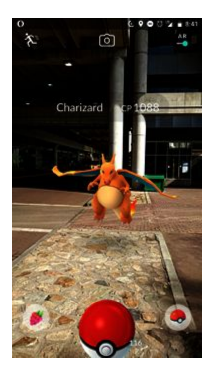
Figure 1: Image from PokémonGo Augmented reality game

trainer. The difference in Pokémon GO is that the game utilizes player's GPS systems on their phone to find Pokémon in the real world. These Pokémon could be found in parks, stores, libraries, and other public places around the world. Instead of staying in one place, the game forced players to walk around their neighborhoods to find new Pokémon to capture. When a player came across a Pokémon, they could see an image of the monster in front of them through their phones (Thier, 2016).